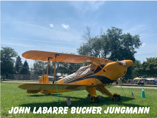
JOHN LABARRE BUCHER JUNGMANN

On this page are chapter 974 aircraft that flew to Airventure 2021. Several members camped with their aircraft and reported excellent amenities in the Homebuilt Camping area. The editor thanks all who answered the call for photos of their ships and campsites. I hope none were missed. The ultimate adventure is camping with your aircraft. Photo credits go to those names shown in each photo.