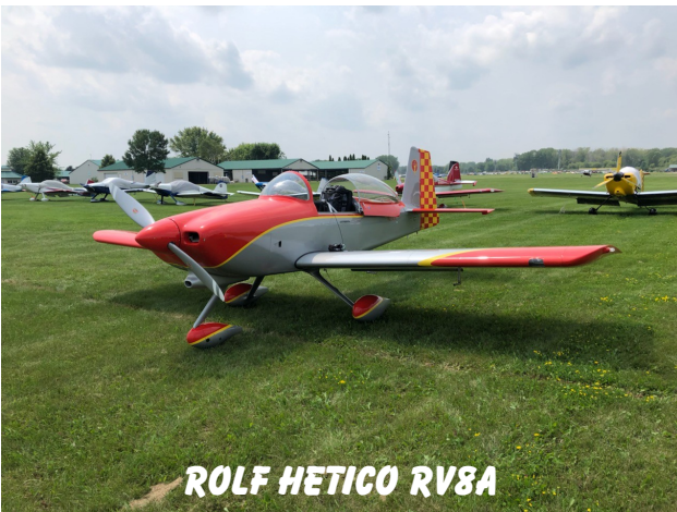
ROLF HETICO RV8A