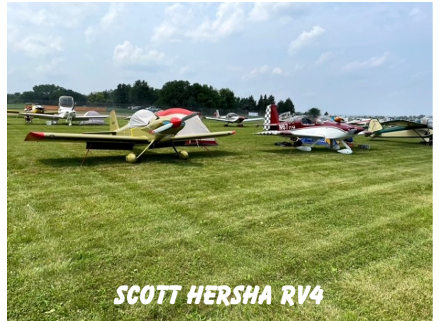
SCOTT HERSHA RV4