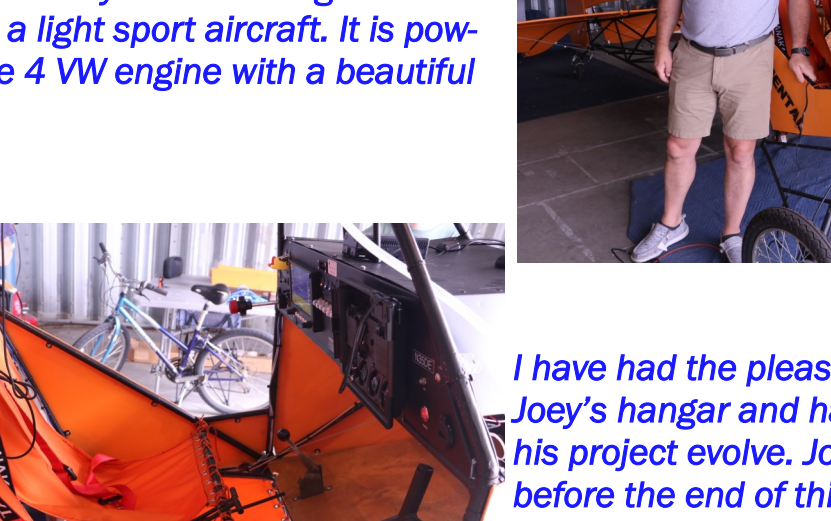
Check out the papel all lit up on the right

This year's Crawl would not be complete without seeing VP Joey Shreve's Double Eagle. In hangar T2I. It's based on the original Legal Eagle ultralight. Joey's Double Eagle will be registered as a light sport aircraft. It is powered by a type 4 VW engine with a beautiful Culver prop.