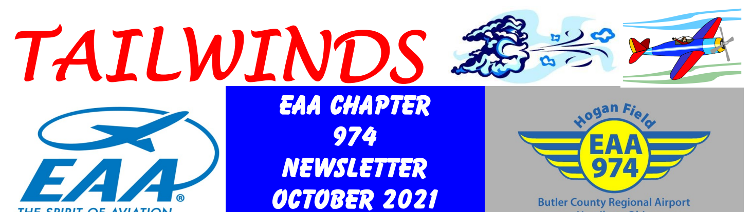
Butler County Regional Airport Hamilton, Ohio