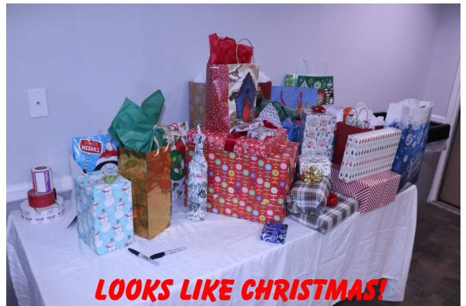
LOOKS LIKE CHRISTMAS!