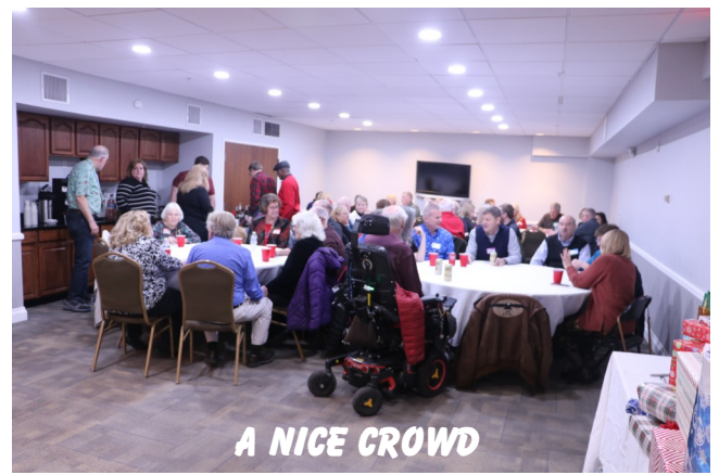
A NICE CROWD