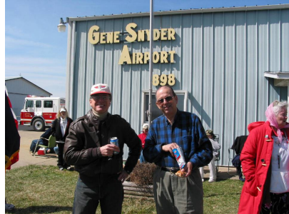
A beautiful day to fly