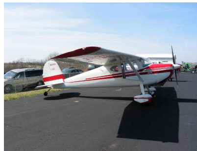
Charlie Corders Cessna 140