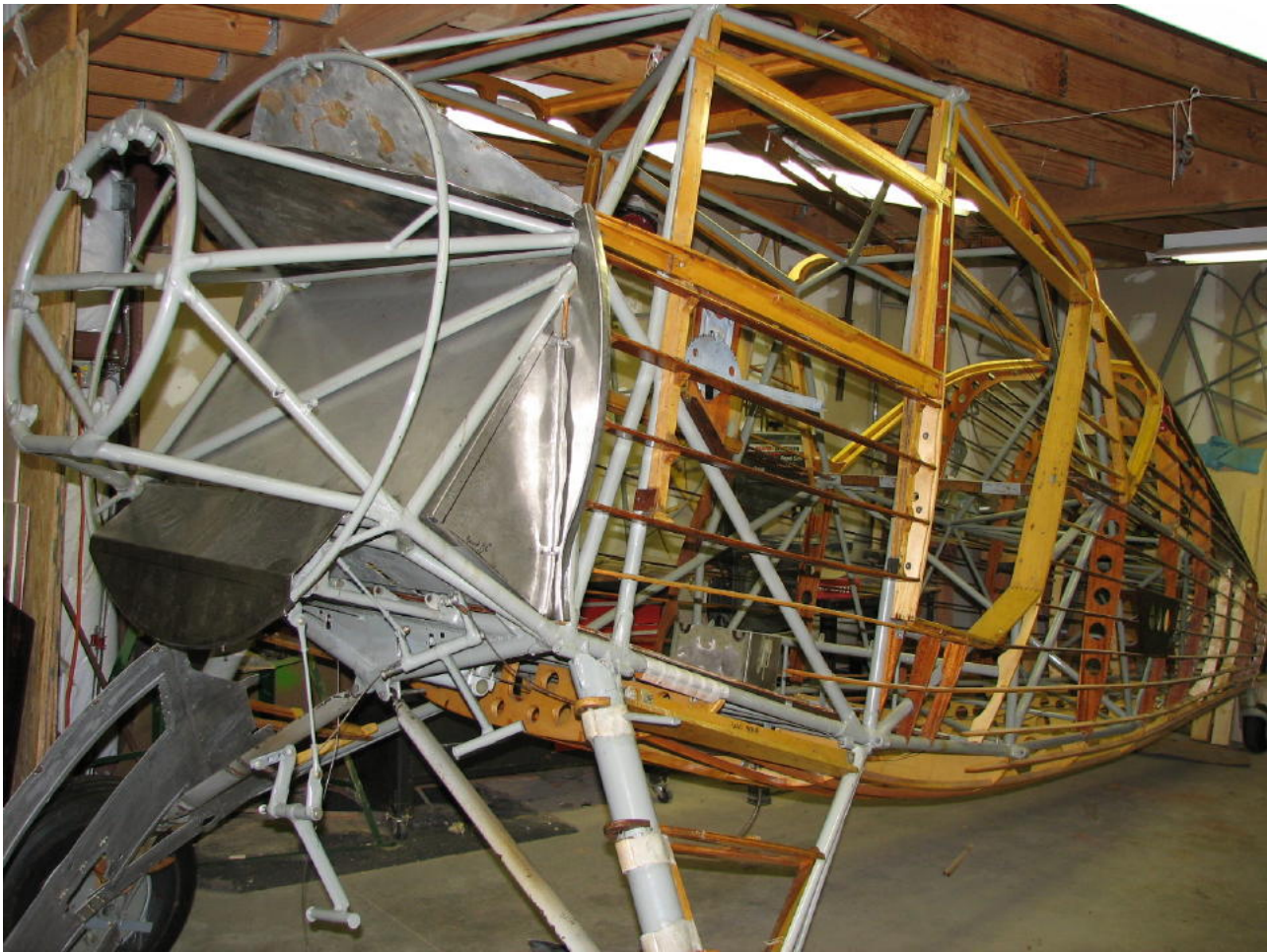
The Hogan's Waco Cabin Restoration