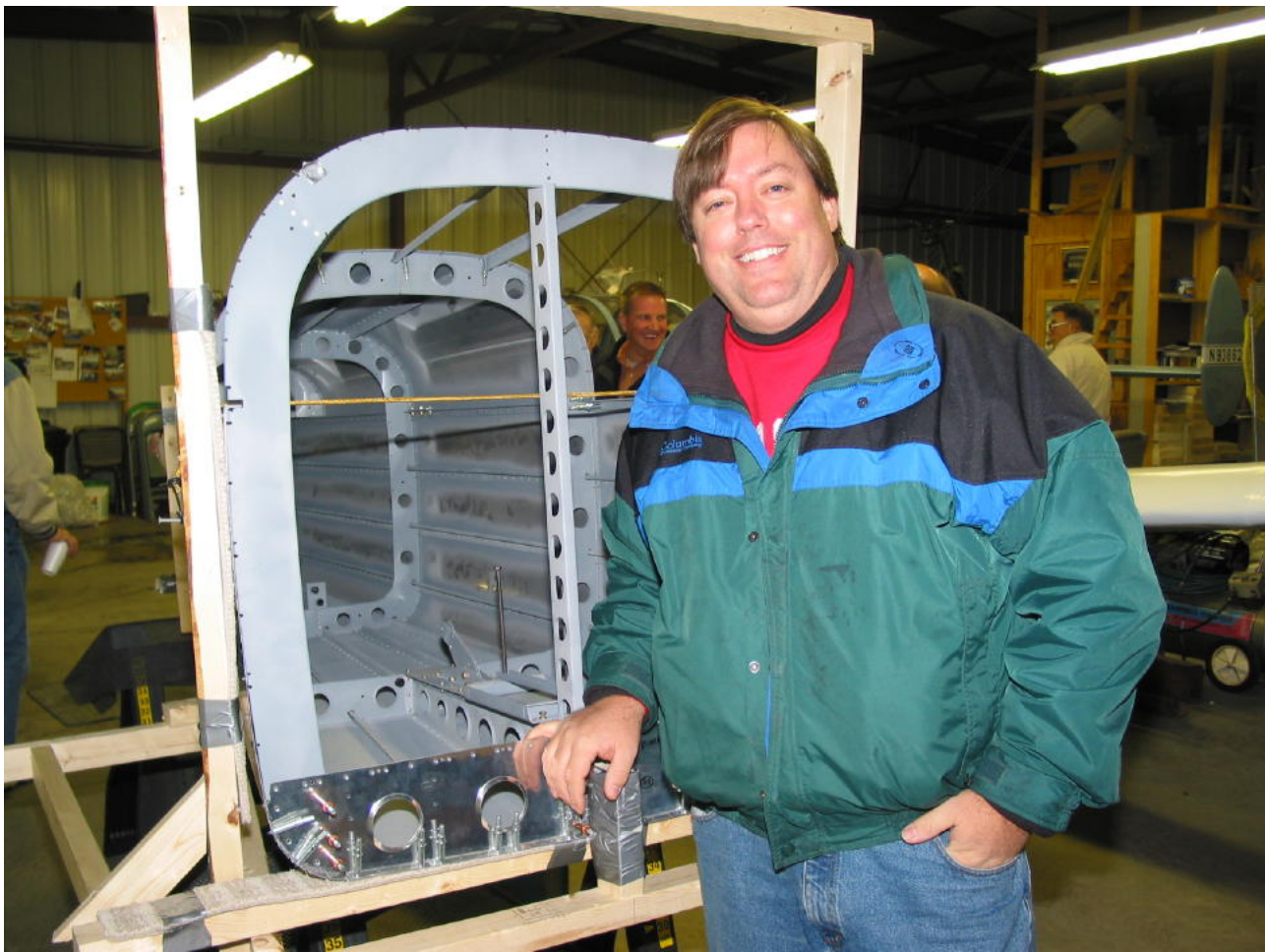
Kent Forsythe's RV-10 tail cone