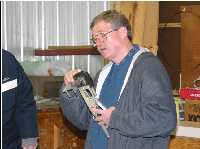
This tool dimples your sheet, which not only makes it more attractive when it smiles, allows a flathead rivet to sit flush.... particularly good on the exterior