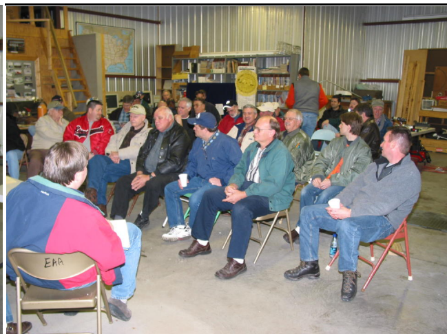
Look at all of those people, and 5 new members!