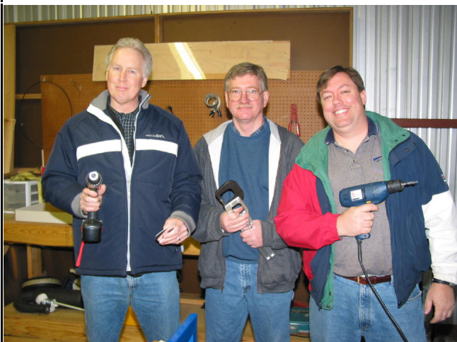
These guys are either going to rivet something, or hold up a hardware store