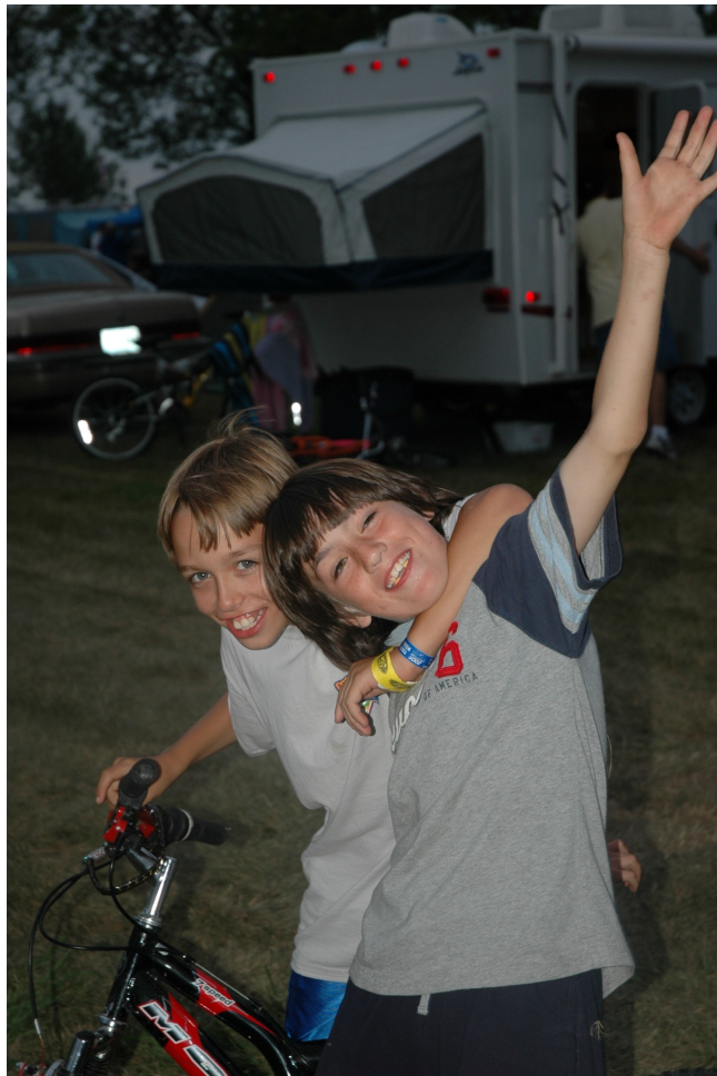
Hey, no rough-housing