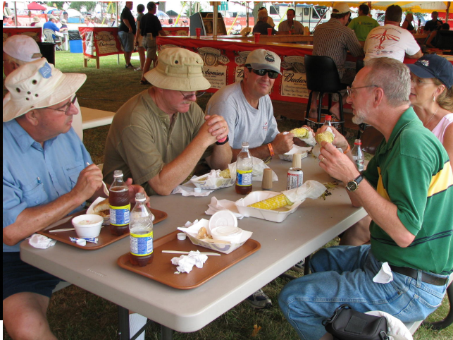
Beer Tent dinners....