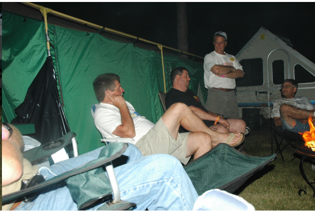
.... becomes campfire chat session