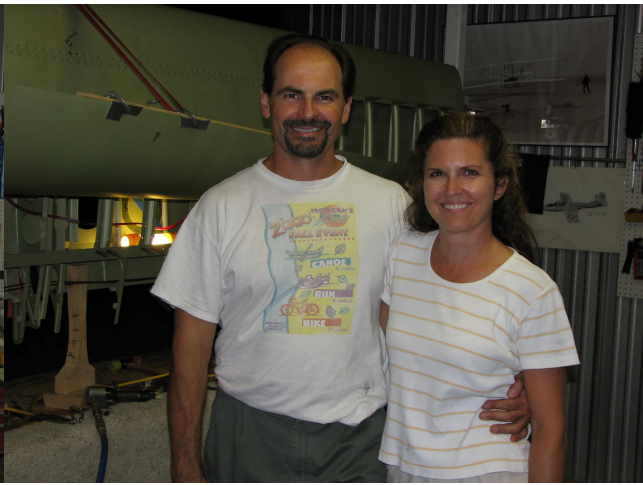
and without the safety gear