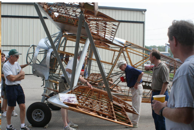
It sorta looks like a plane this year! OUTSTANDING work guys