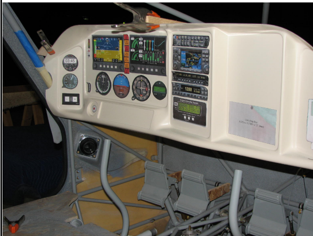
Howard's panel - I'm assured that FAA inspectors do not test the avionics, soo.....