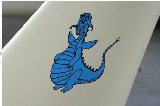
Puff the magic dragon lived with Ray....