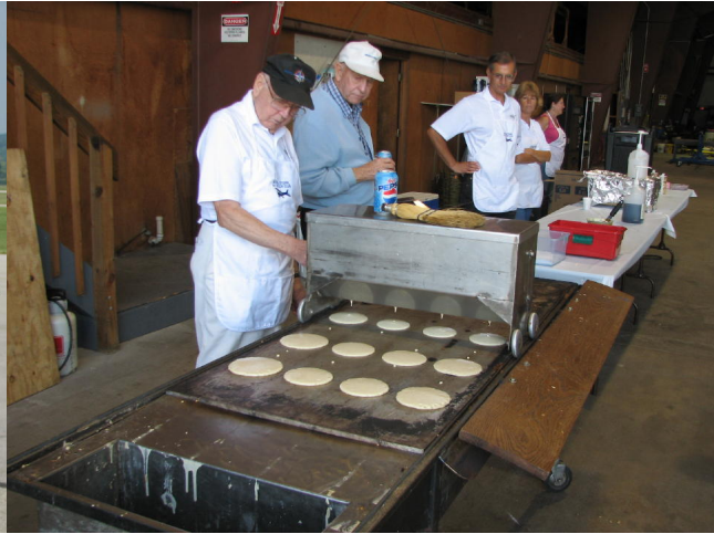
These things are selling like... hotcakes...