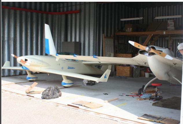
and his airplane menagerie, this is the Dragonfly