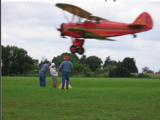
Suddenly a 1:1 scale flies into frame....