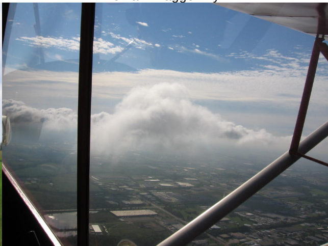
This move isn't entirely legal