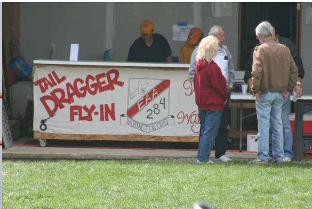
The Tail-Dragger Fly-in