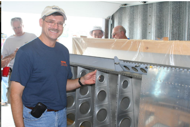
Rolf Hetico's RV-8