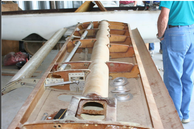
Ken's fuel tank... someday...