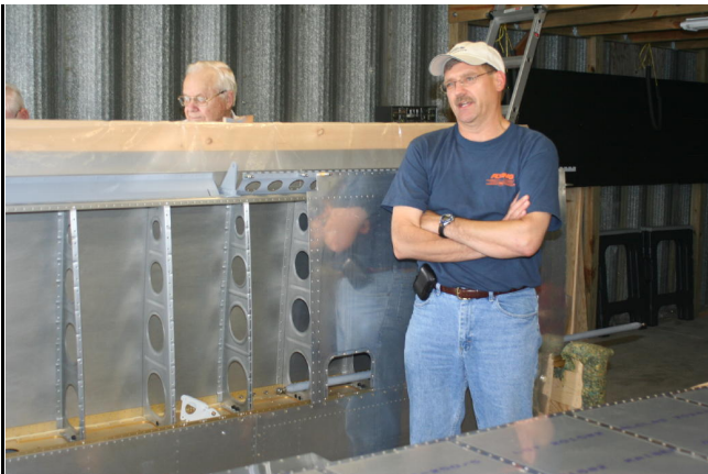
This, I'm told is a wing, but I can't find the glass for the life of me....