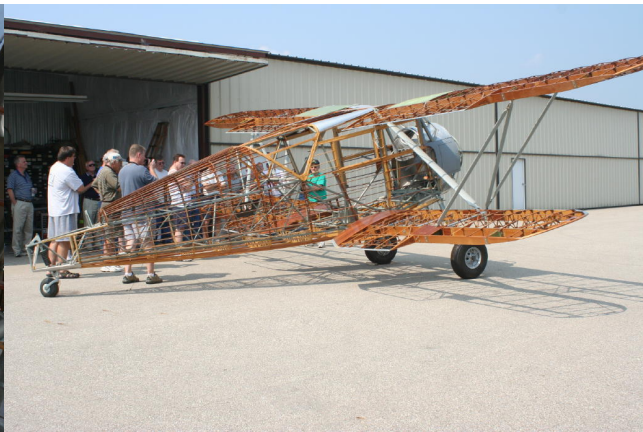
The Hogan's Waco UKC Restoration