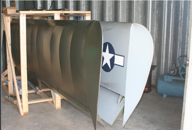
The Reliant's wings