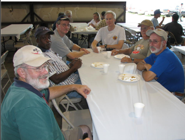
That's good eatin'