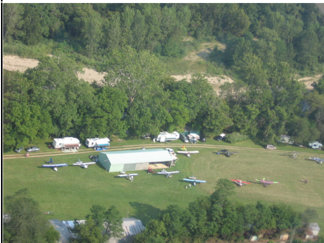
Wingnuts Field Flyover

Bob Dombek was good kind enough to also provide me with pictures of the Nulltown flyin, which seems quite nice for the folks that can land on grass. Click on a picture for a larger version.