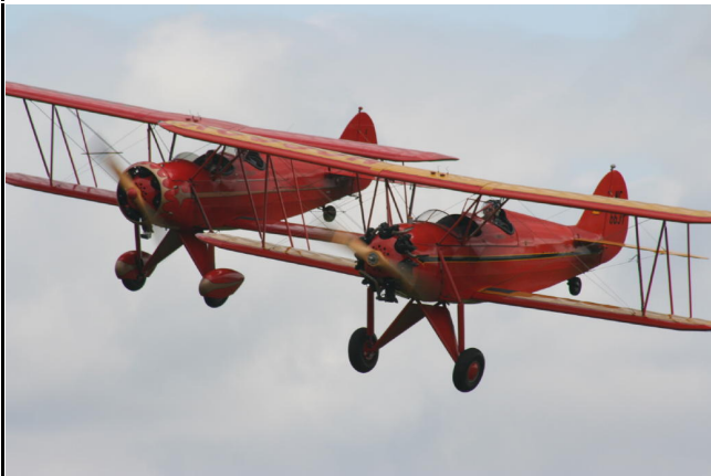
Those wonderful men in their flying machines

The Tail Dragger fly-in is why I'll need another airplane someday. It's just too much fun to miss, but Red Stewart field is not on the Velocity's port-of-call list either. This is a real 'spirit of aviation' event, and if you missed it this year, do yourself a favor and make it next time, because this and the Waco fly-in really take you back to aviation's roots. Click on a picture for a larger version.