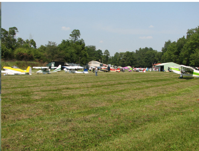
hmm... no Velocitys... BIGOTS!