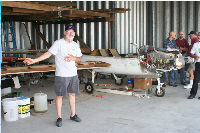
and his White Lightning