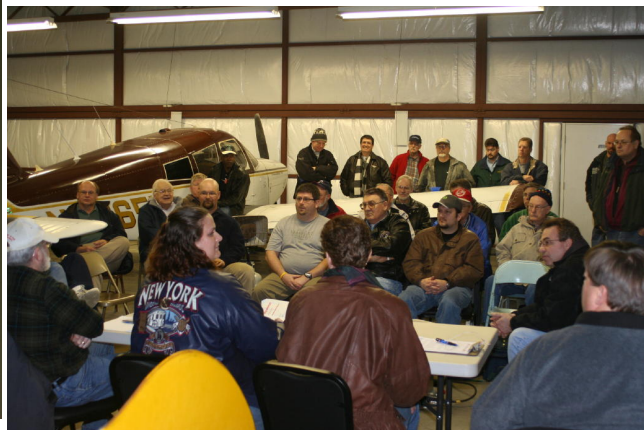
Not a bad crowd at all for March!