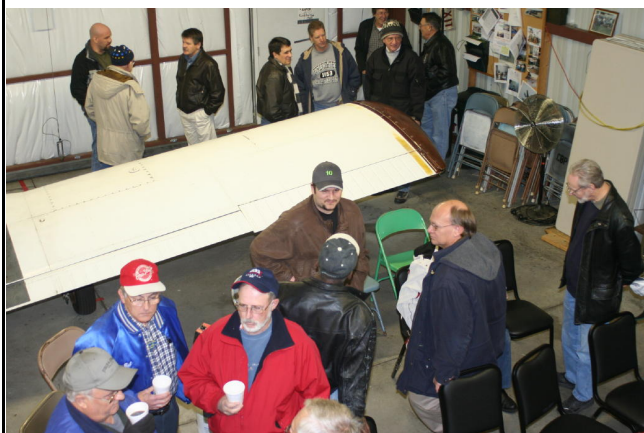
Direct from the Artemis Center, this wing seems to be causing quite a back-up....