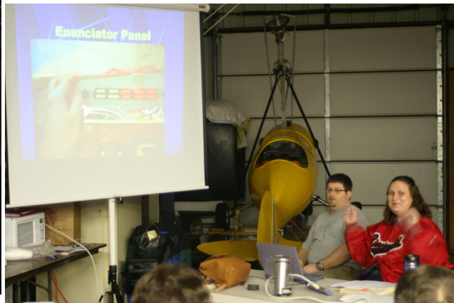
There's my coat! Walking folks through the electrical goodies.