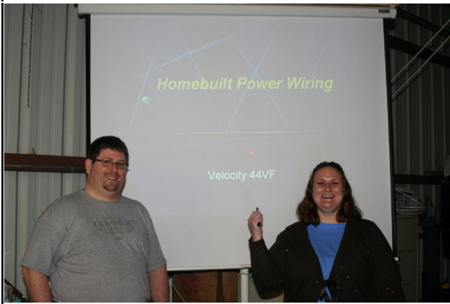
A warm day drives me to go shirtless.... and, man oh man do I love PowerPoint

Also discussed where noise considerations, such as installing current limiters on the firewall for the alternator, rather than bringing that noise source onto the circuit breaker panel, and ground loops (no, not that kind). We covered a lot of ground, but hopefully we didn't move too quickly, nor bore too many folks. I handed out schematics at the meeting, but you can check them out online if you wish at top of this page .