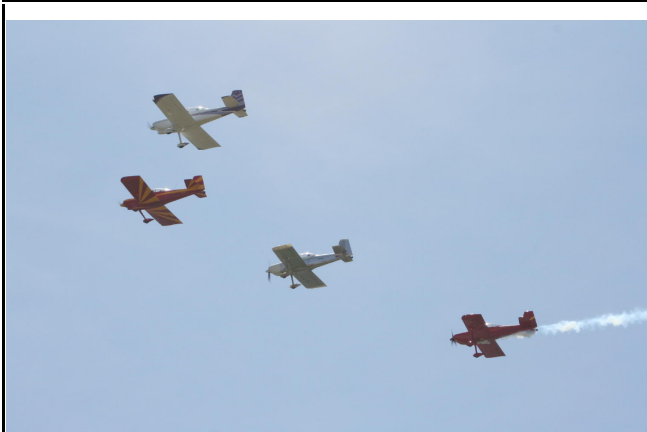
RVs pass in review... smoke on...