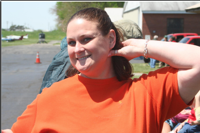
Strike a pose, there's nothing to it.. Vogue..Vogue..Vogue