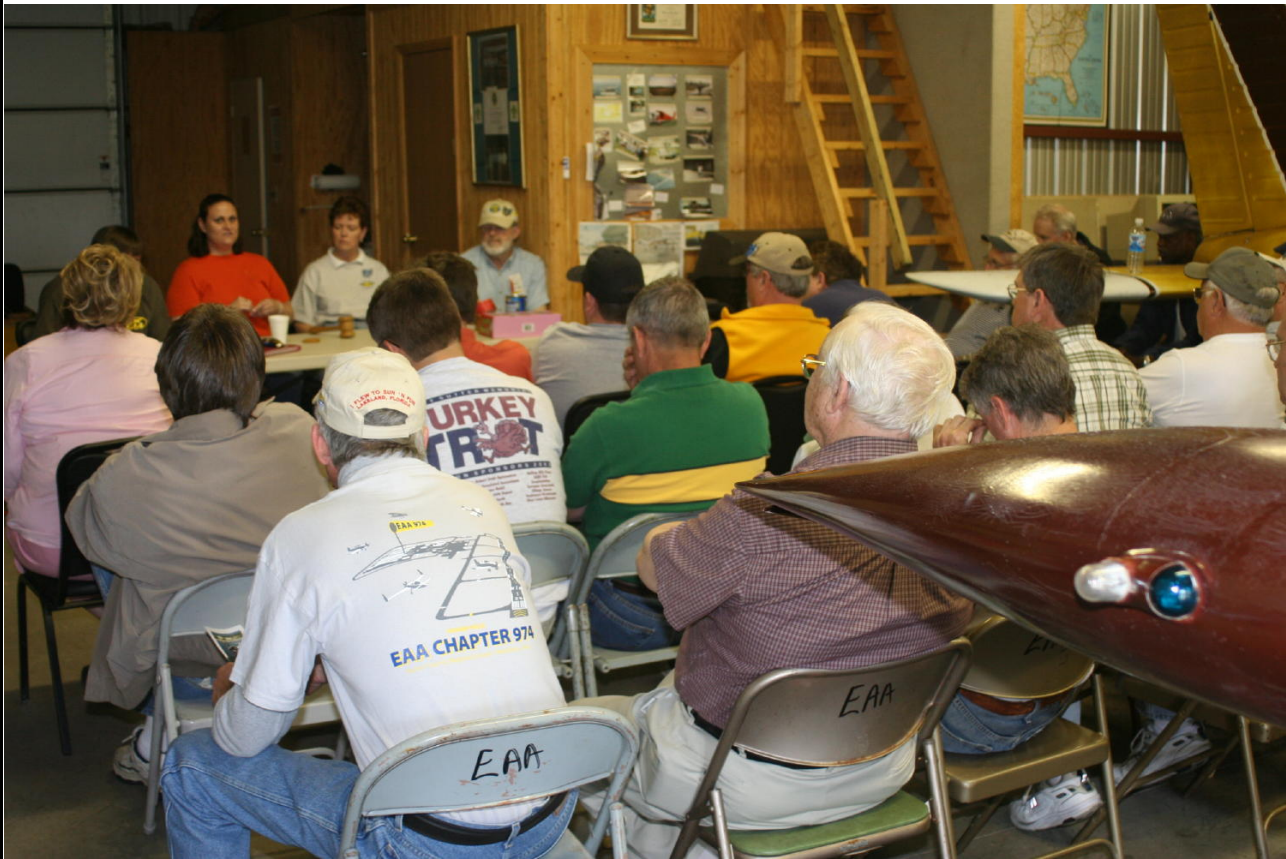
It was a great day to be at the airport