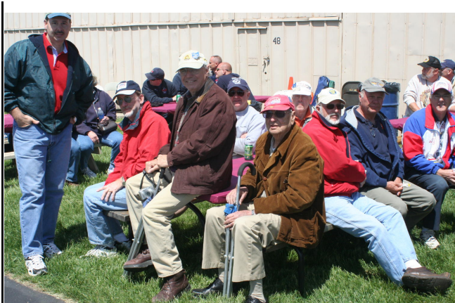
A post-food happiness settles into the crowd.