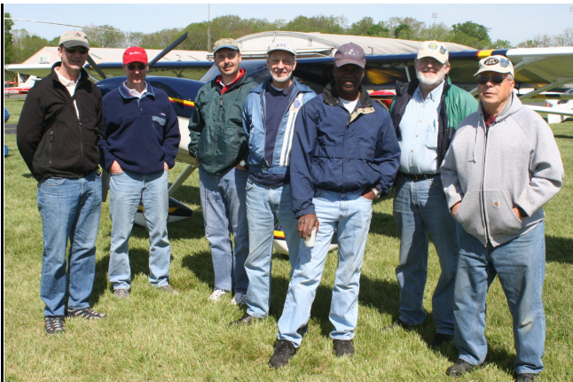
About half of the motley crew that we brought to the party