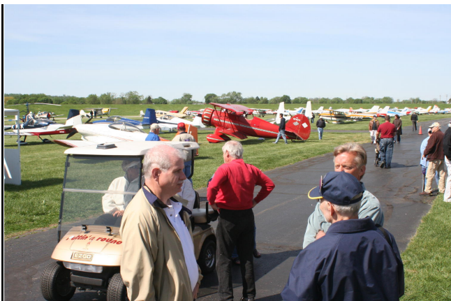
A busy flightline