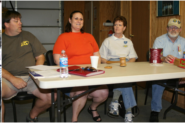
Our 'colorful' President presides