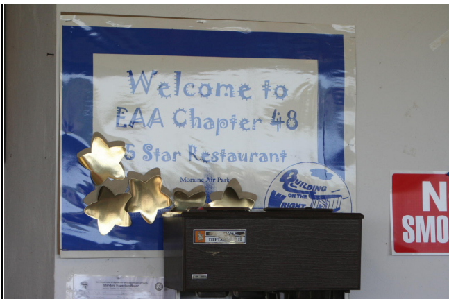
Chow line bragging