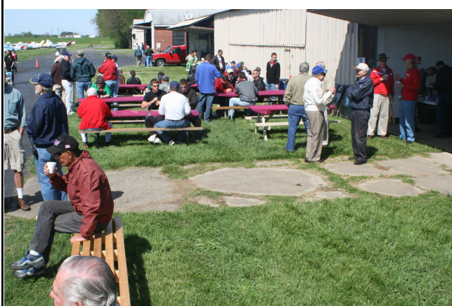
The picnic tables were kept busy...