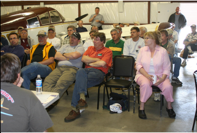
Note to self... move the airplanes out before setting up chairs