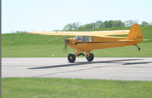
A cub turns into the wind... and is airborne instantly (it was breezy)