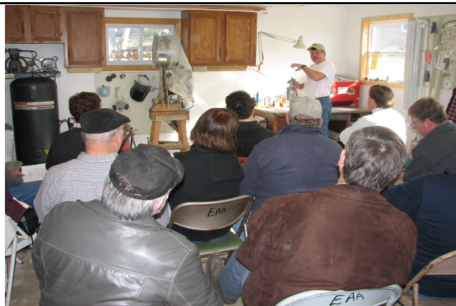
The Teacher starts show & tell