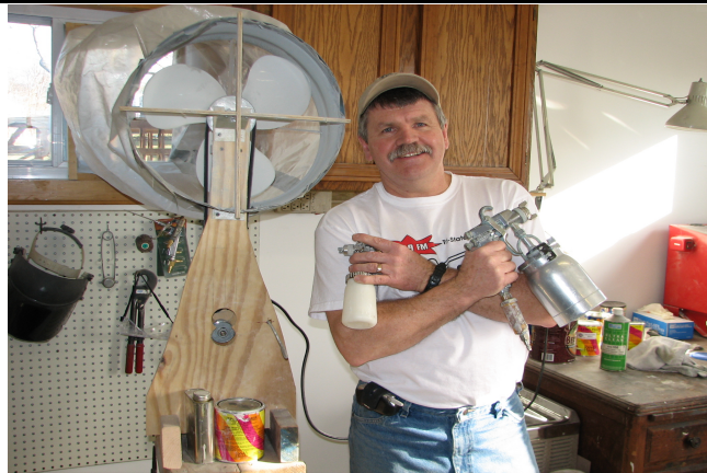
Have gun, will travel... the sign of a man...