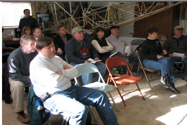
The sun actually came out, which was good with the bitter wind