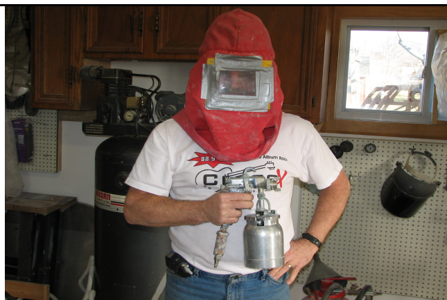
Red Adaire? - Oh, you need A-I-R....