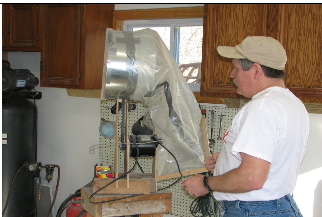
The biggest windsock EVER