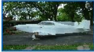
Brad Ankerstar KR2

Our chapter has many flying aircraft and lots of things under construction. Click on the links below to see photos of the aircraft types as well, with links to individuals personal websites where available.