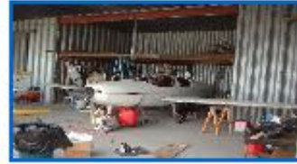
Ken Jones White Lightning

Once you select a project, you'll be presented with a set of options for project. You can select to start a slideshow outlining the history of the project, or select individual pictures from a series of thumbnails.