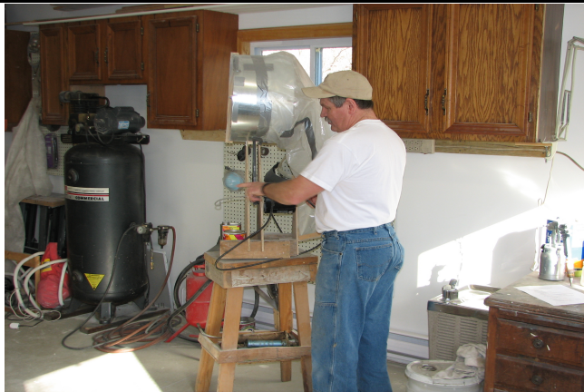
Oh, apparently this is a dust collector