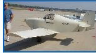
Tom Koch KR2