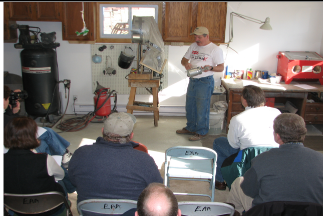
and the paint goes here