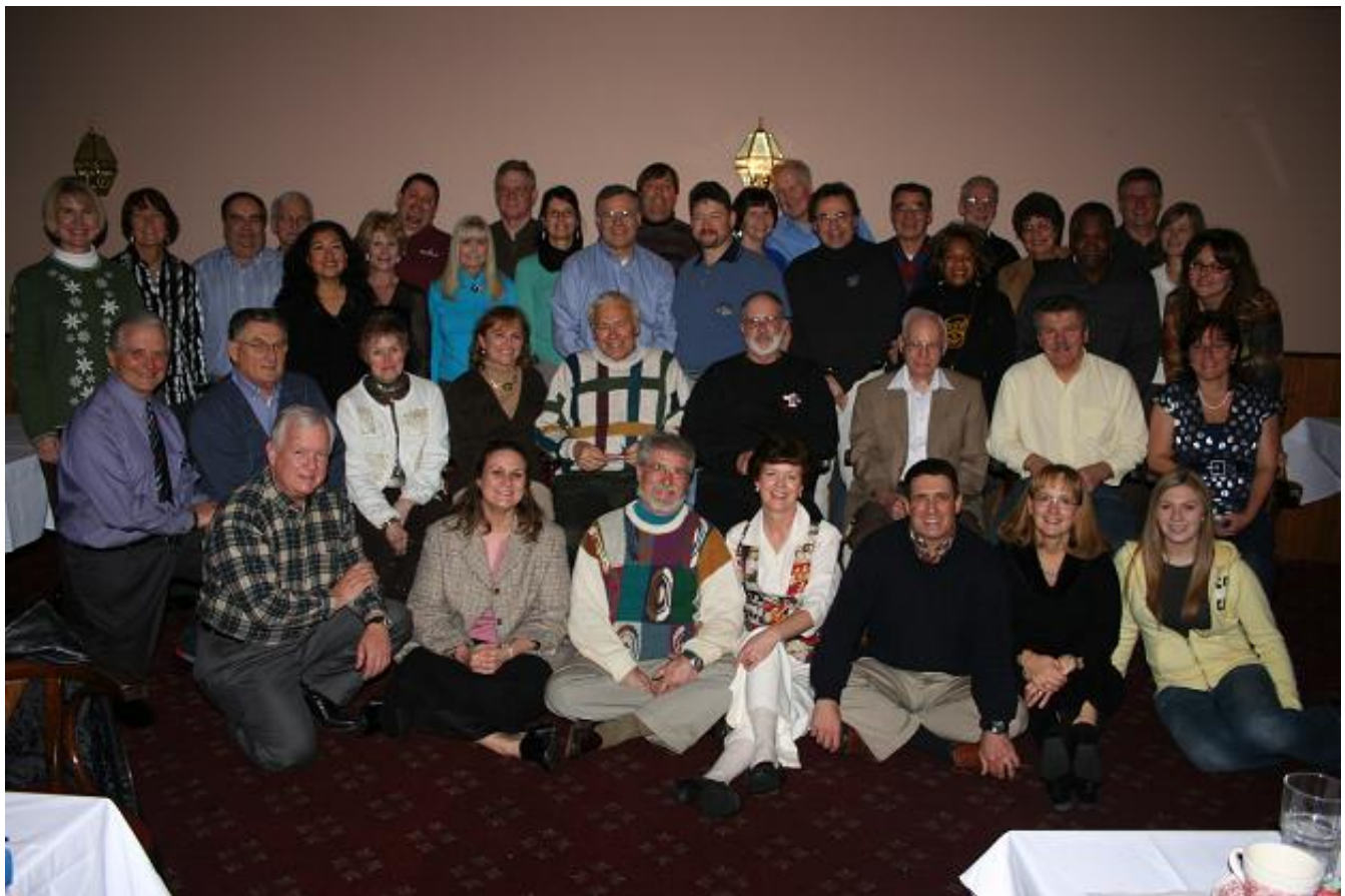
EAA 974 Members, 2009