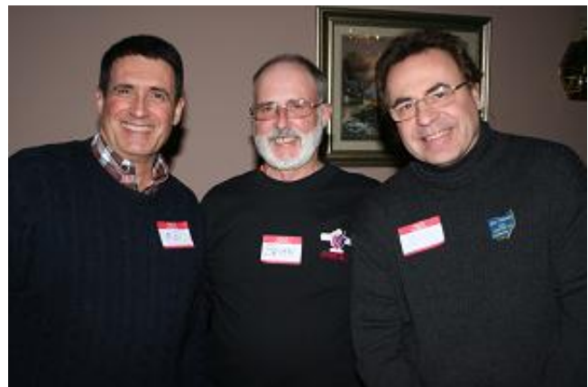
2009 Board Members