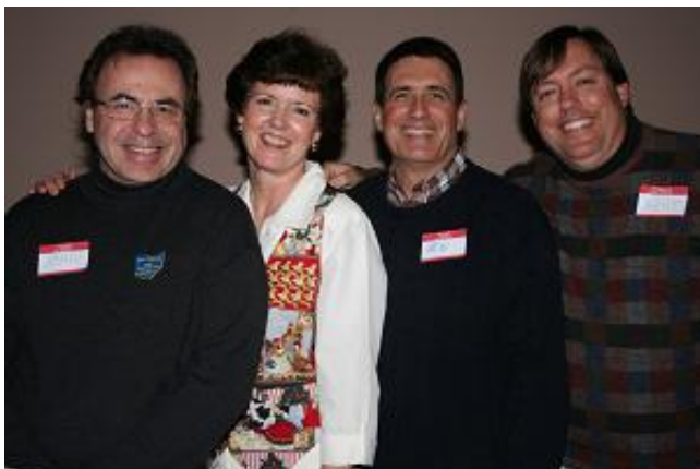
2008 Board Members