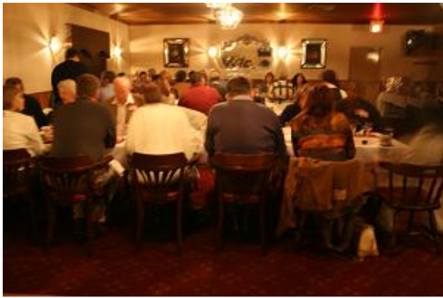
The Banquet Hall