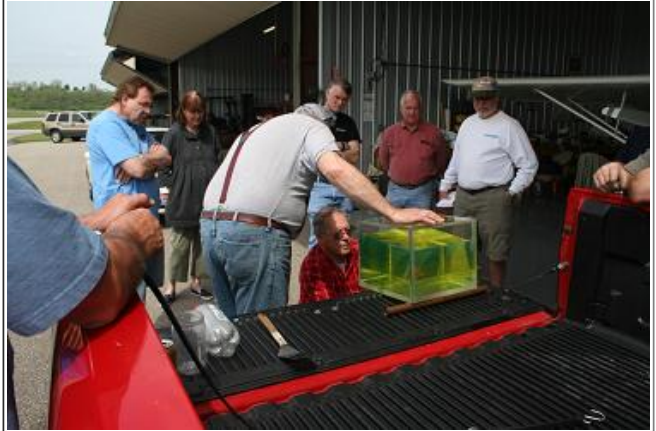
Roger's Invention in Action