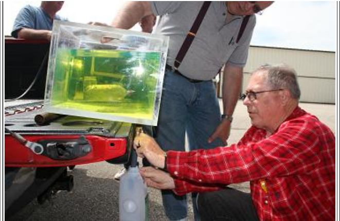
Step 4- Draw off the Water leaving Ethanol Free gas in the container.