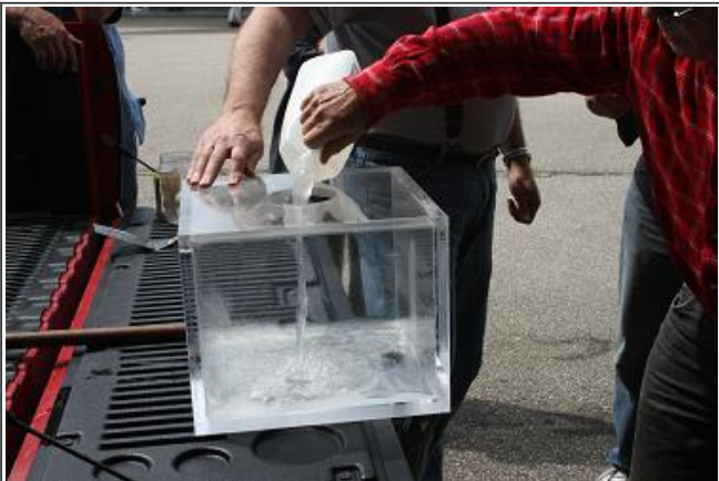
Step 1 - Add Water