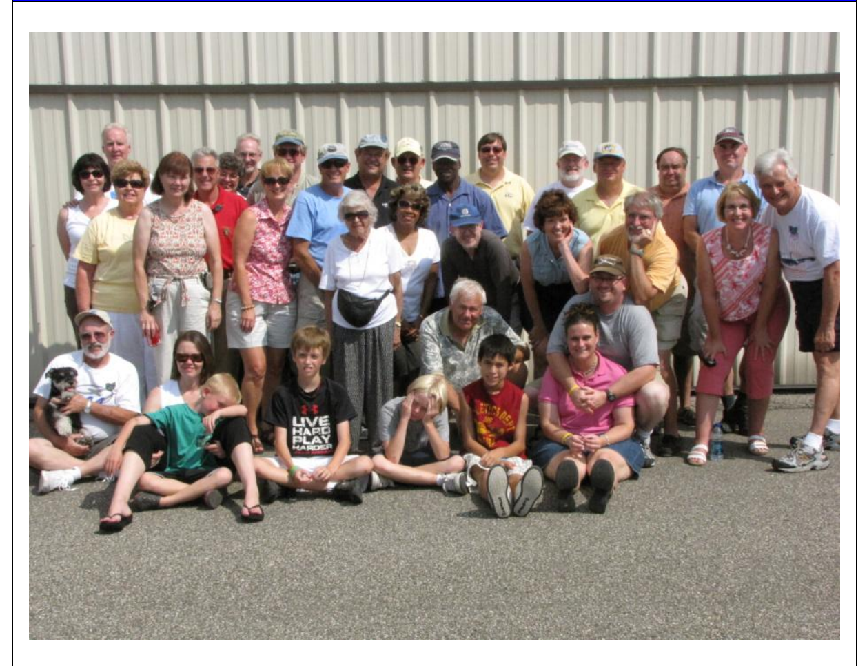
EAA Chapter 974—2009 Members and Family