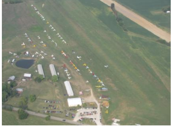
Red Stewart Field