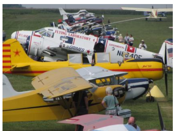
More Tail Draggers