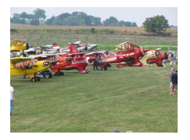
Tail Draggers at the Red Steward Flyin