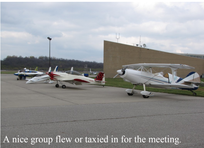
A nice group flew or taxied in for the meeting.