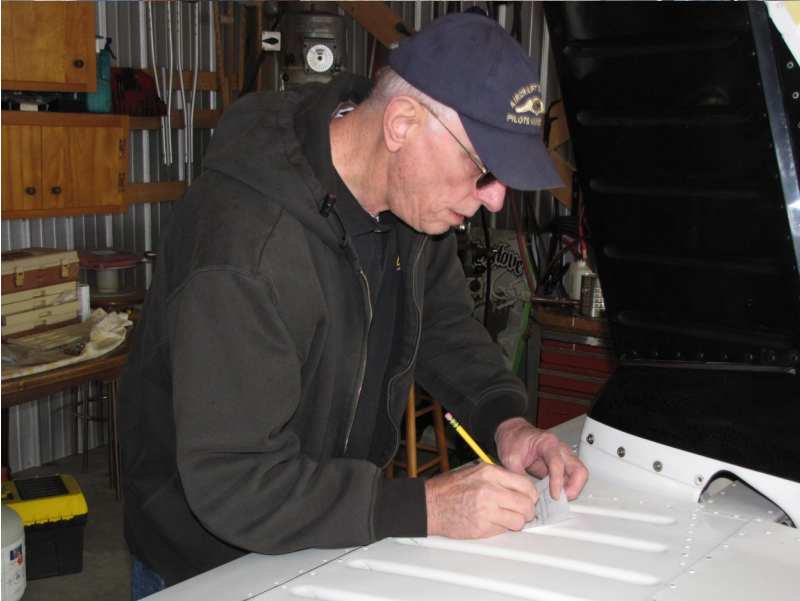
JOHN'S MAKING A LIST AND CHECKING IT TWICE!