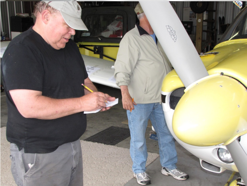
MARK'S LIST IS GROWING TOO!