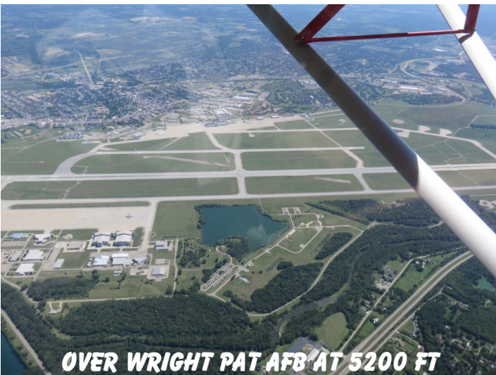
OVER WRIGHT PAT AFB AT 5200 FT

"The airplane stays up because it doesn't have the time to fall" —Orville Wright