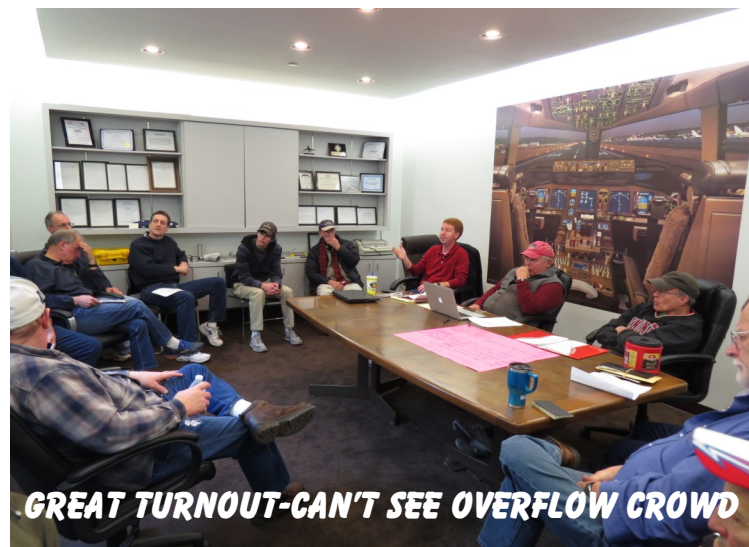
GREAT TURNOUT-CAN'T SEE OVERFLOW CROWD