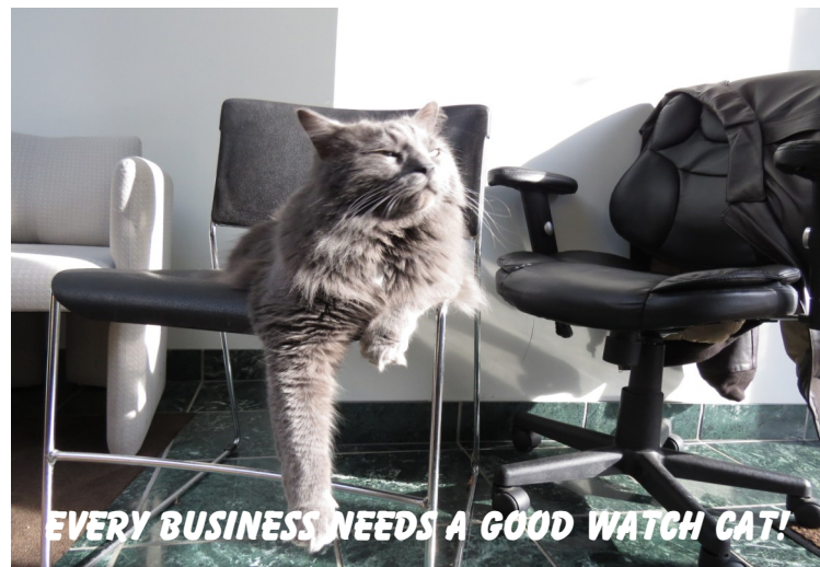
EVERY BUSINESS NEEDS A GOOD WATCH CAT!