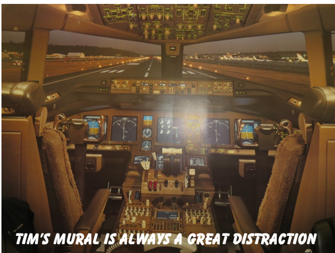
TIM'S MURAL IS ALWAYS A GREAT DISTRACTION