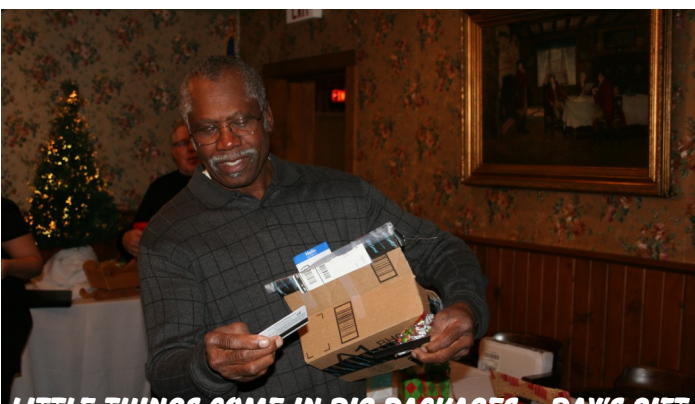
LITTLE THINGS COME IN BIG PACKAGES — RAY'S GIFT CARD WILL BRING SOME GOODIES!