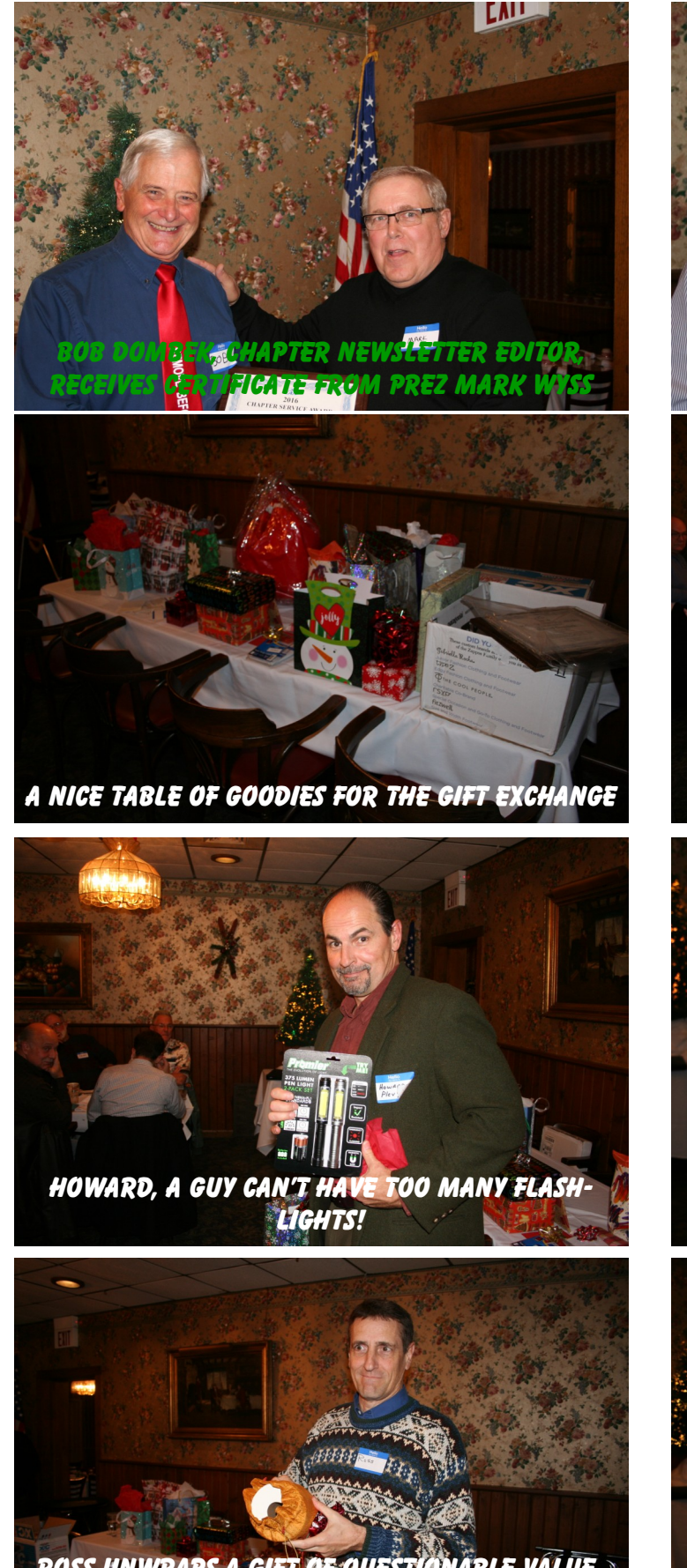
ROSS UNWRAPS A GIFT OF QUESTIONABLE VALUE THAT EVERYONE USES AND COMES IN HANDY FOR AERIAL BOMBARDMENT (ASK ME HOW I KNOW!)