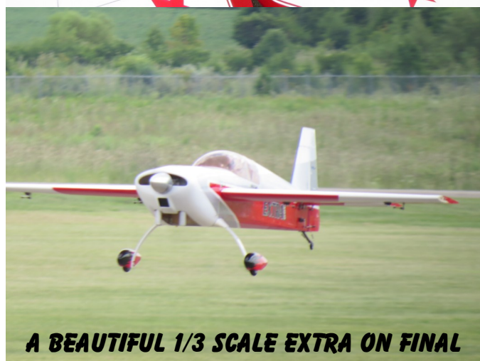
A BEAUTIFUL 1/3 SCALE EXTRA ON FINAL