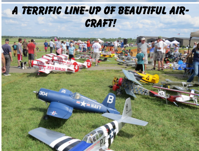
A TERRIFIC LINE-UP OF BEAUTIFUL AIRCRAFT!