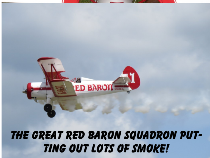
THE GREAT RED BARON SQUADRON PUTTING OUT LOTS OF SMOKE!