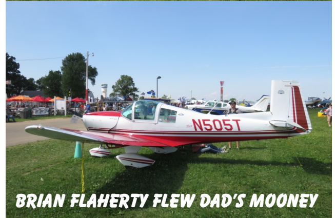
BRIAN FLAHERTY FLEW DAD'S MOONEY