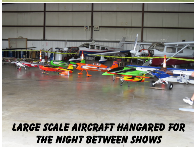
LARGE SCALE AIRCRAFT HANGARED FOR THE NIGHT BETWEEN SHOWS