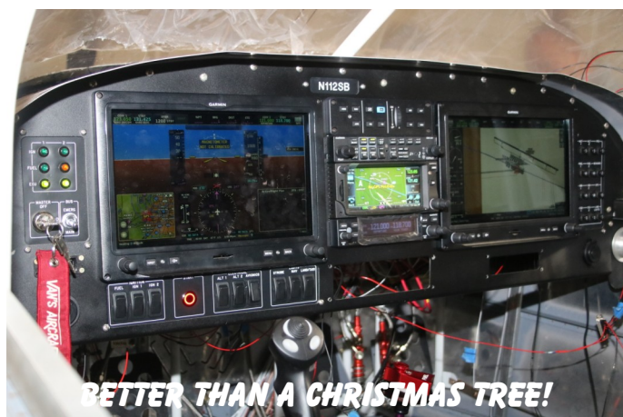
BETTER THAN A CHRISTMAS TREE!