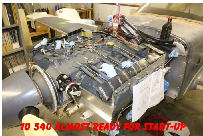
IO 540 ALMOST READY FOR START-UP