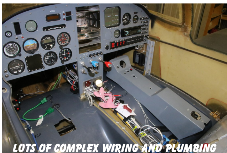
LOTS OF COMPLEX WIRING AND PLUMBING