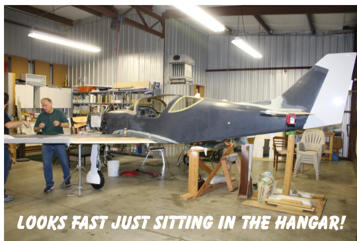
LOOKS FAST JUST SITTING IN THE HANGAR!