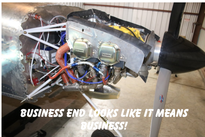
BUSINESS END LOOKS LIKE IT MEANS BUSINESS!