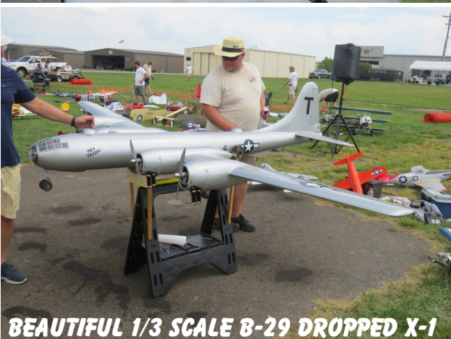
BEAUTIFUL 1/3 SCALE B-29 DROPPED X-1