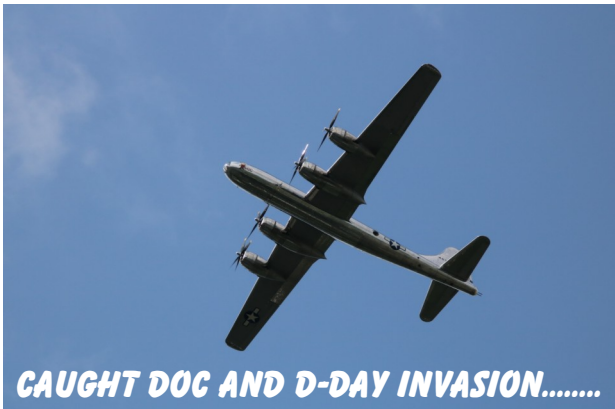
CAUGHT DOC AND D-DAY INVASION.....