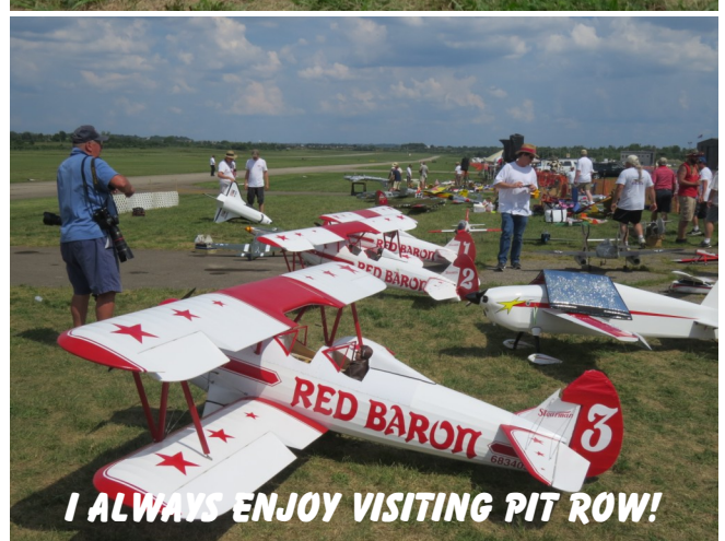
I ALWAYS ENJOY VISITING PIT ROW!