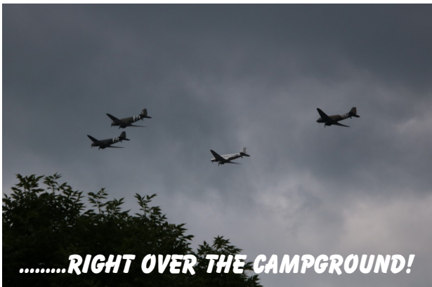
.....RIGHT OVER THE CAMPGROUND!