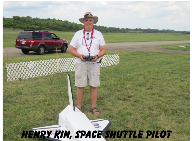
HENRY KIN, SPACE SHUTTLE PILOT