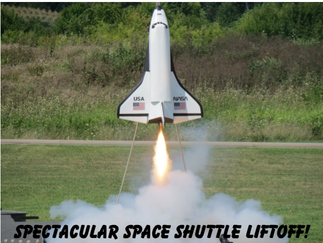
SPECTACULAR SPACE SHUTTLE LIFTOFF!