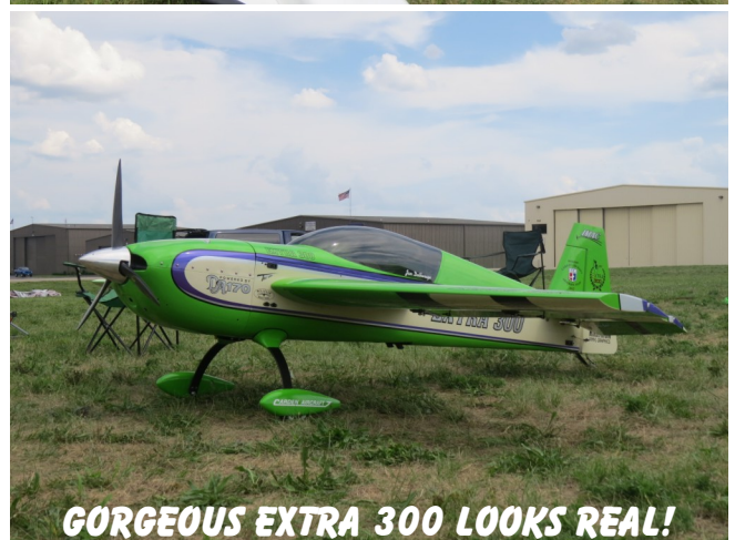
GORGEOUS EXTRA 300 LOOKS REAL!