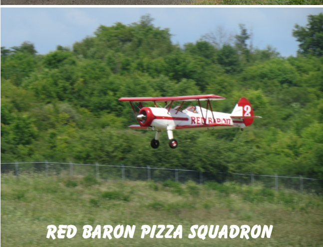
RED BARON PIZZA SQUADRON