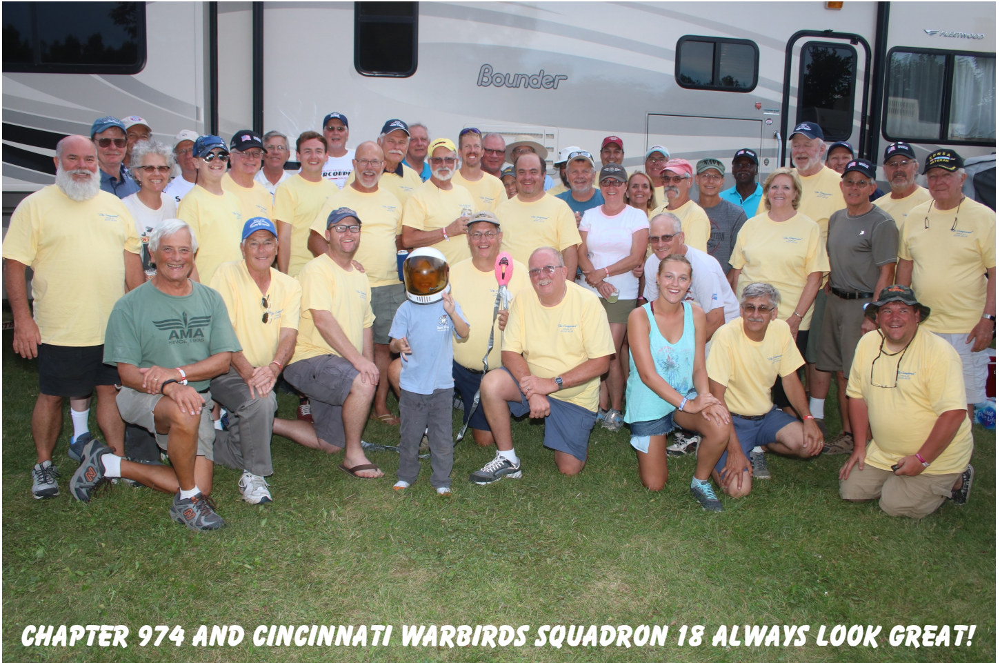
CHAPTER 974 AND CINCINNATI WARBIRDS SQUADRON 18 ALWAYS LOOK GREAT!