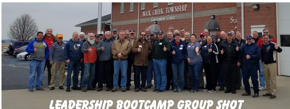
LEADERSHIP BOOTCAMP GROUP SHOT