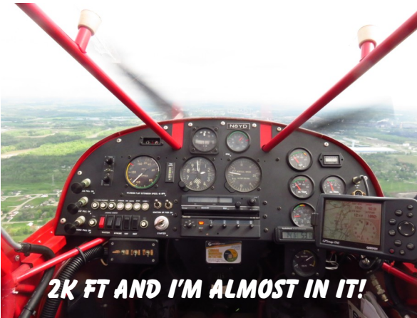
2K FT AND I'M ALMOST IN IT!