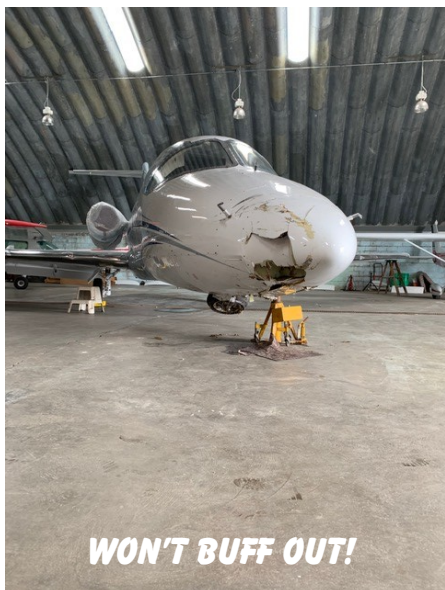
WON'T BUFF OUT!