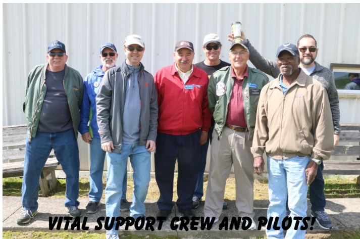
VITAL SUPPORT CREW AND PILOTS!