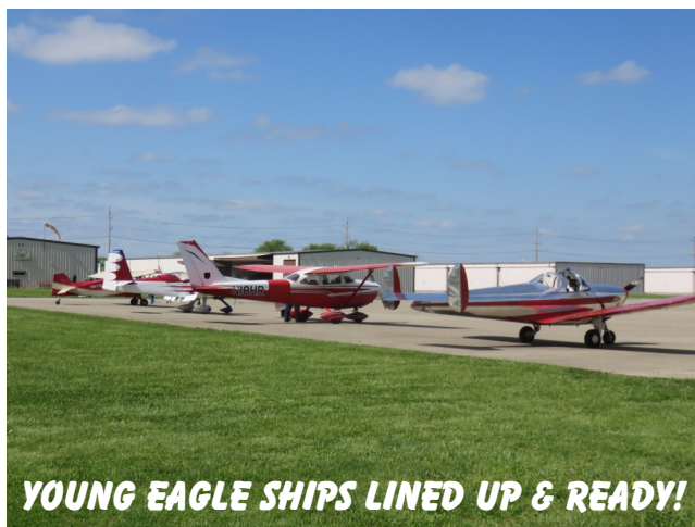
YOUNG EAGLE SHIPS LINED UP & READY!