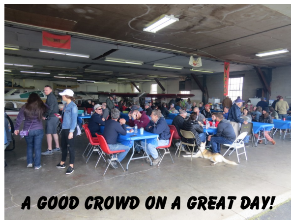
A GOOD CROWD ON A GREAT DAY!