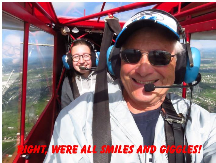
RIGHT, WERE ALL SMILES AND GIGGLES!