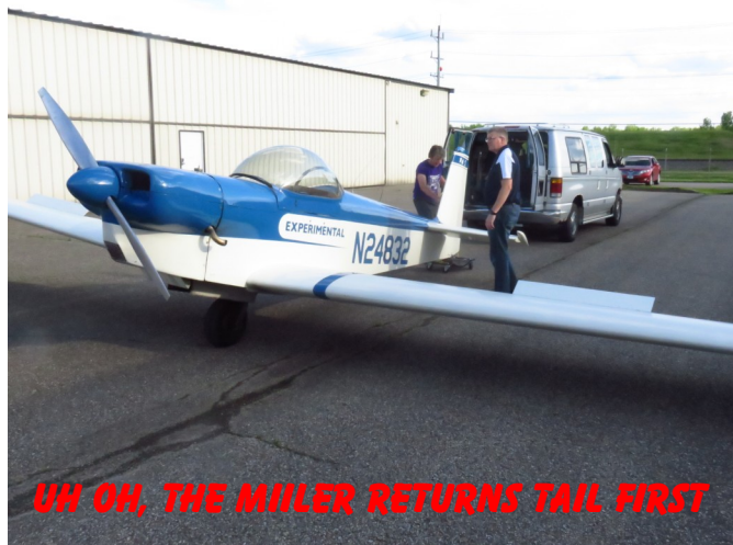
UH OH, THE MILLER RETURNS TAIL FIRST