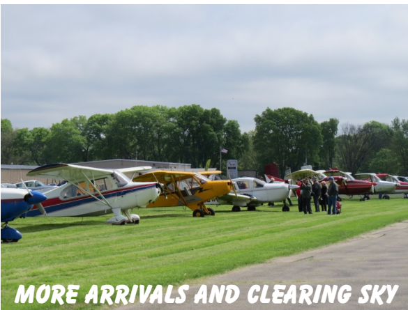
MORE ARRIVALS AND CLEARING SKY