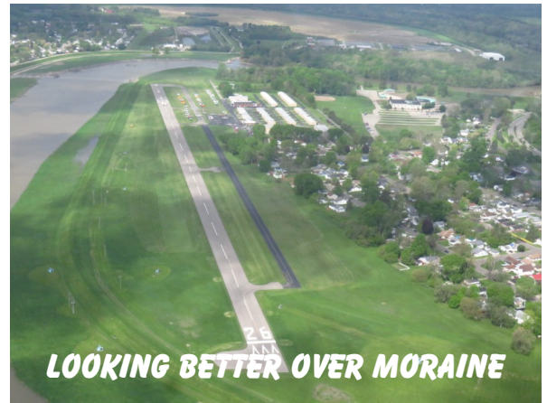
LOOKING BETTER OVER MORAINE