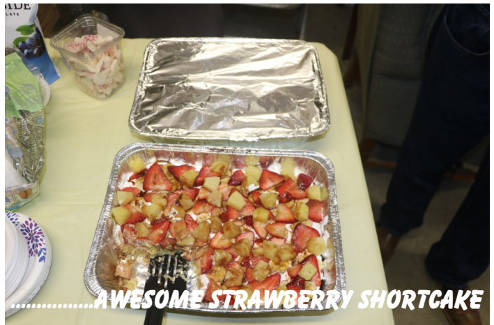
.....AWESOME STRAWBERRY SHORTCAKE