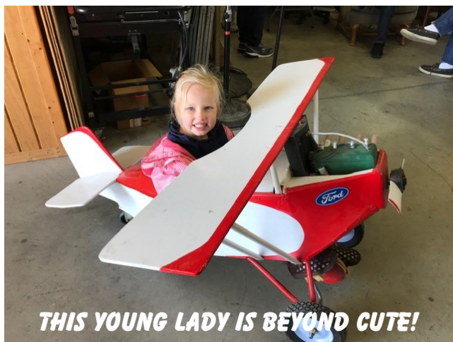
THIS YOUNG LADY IS BEYOND CUTE!