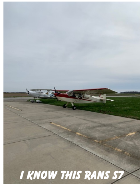
I KNOW THIS RANS S7