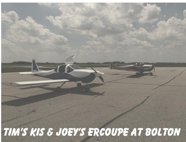
TIM'S KIS & JOEY'S ERCOUPE AT BOLTON