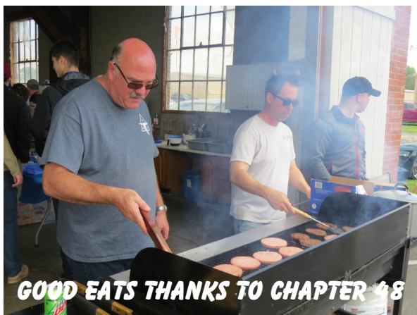
GOOD EATS THANKS TO CHAPTER 48