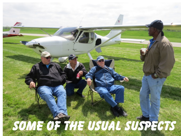
SOME OF THE USUAL SUSPECTS