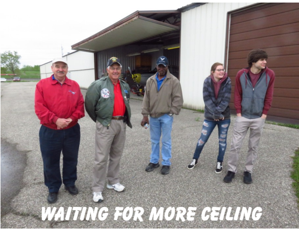
WAITING FOR MORE CEILING