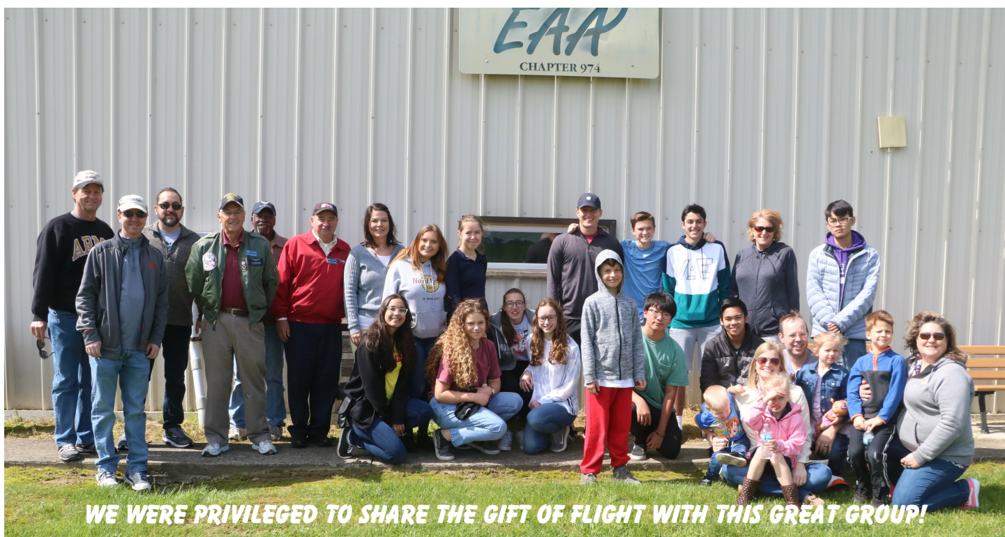
WE WERE PRIVILEGED TO SHARE THE GIFT OF FLIGHT WITH THIS GREAT GROUP!