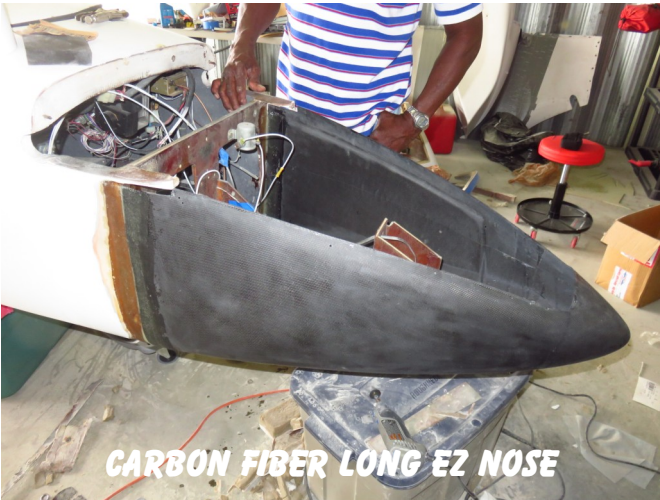
CARBON FIBER LONG EZ NOSE