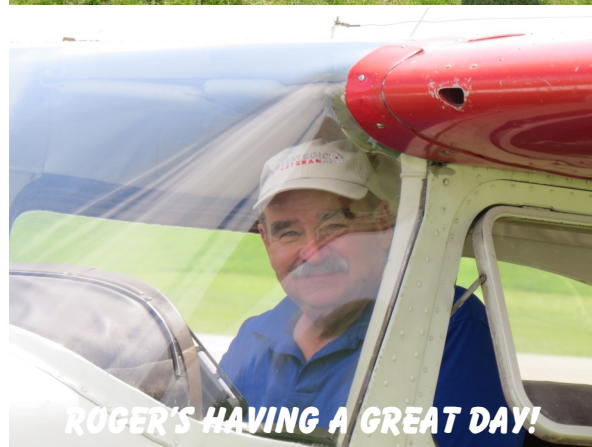
ROGER'S HAVING A GREAT DAY!