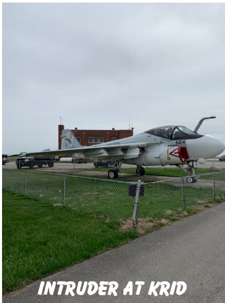
INTRUDER AT KRID