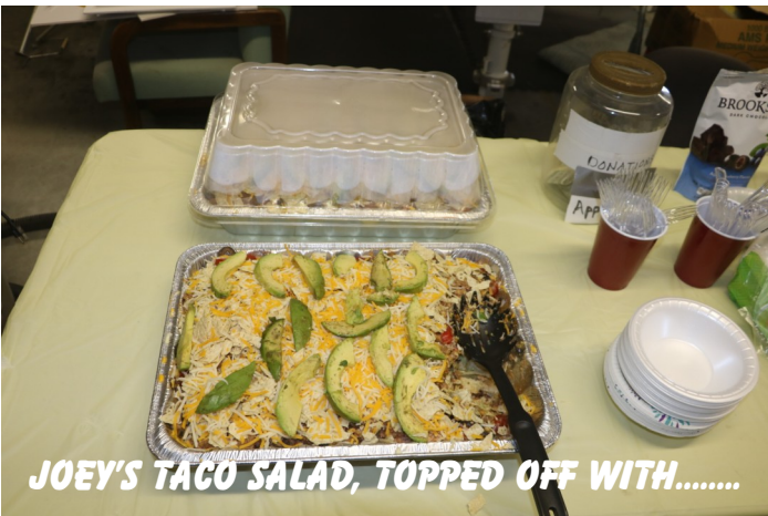
JOEY'S TACO SALAD, TOPPED OFF WITH.....