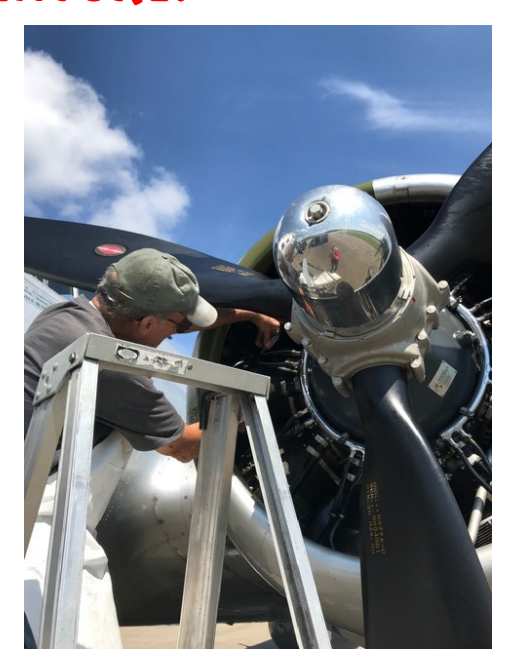
FOR THE HARD WORK OF DOING THIS