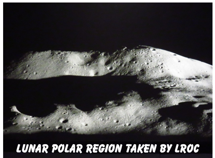
LUNAR POLAR REGION TAKEN BY LROC