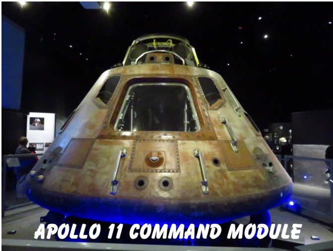
APOLLO 11 COMMAND MODULE

I could not publish the newsletter without including some pictures from the Apollo 11 exhibit at the museum center. I was there during one of it's last days and would have kicked myself for missing it. A surprise bonus was the spectacular gallery of photos taken by the Lunar Reconnaissance Orbital Camera or LROC. The polar region photo shows the deep shadows at the poles, possible sites for settlements due to constant temps, less radiation.