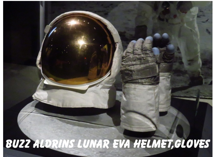
BUZZ ALDRIN'S LUNAR EVA HELMET, GLOVES