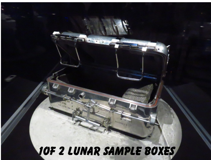
1 OF 2 LUNAR SAMPLE BOXES