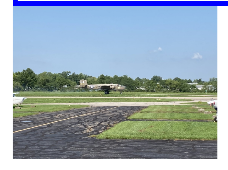
Pictures from visit to the Tri-state Warbird Museum. See Page 8 Sent by Tom Martin

http://wiki.eaa974.org —- chapter wiki page