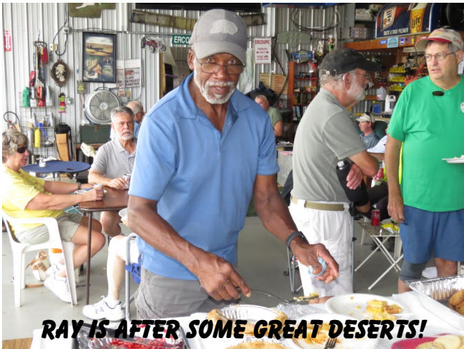
RAY IS AFTER SOME GREAT DESERTS!