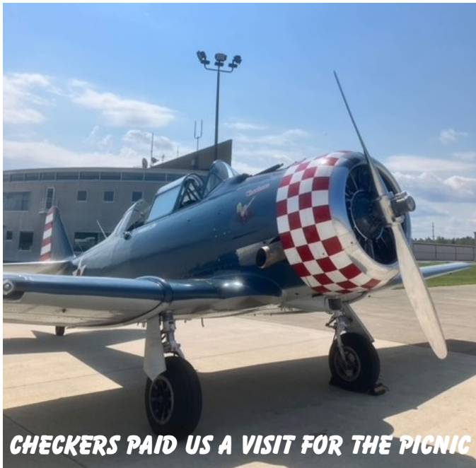
CHECKERS PAID US A VISIT FOR THE PICNIC