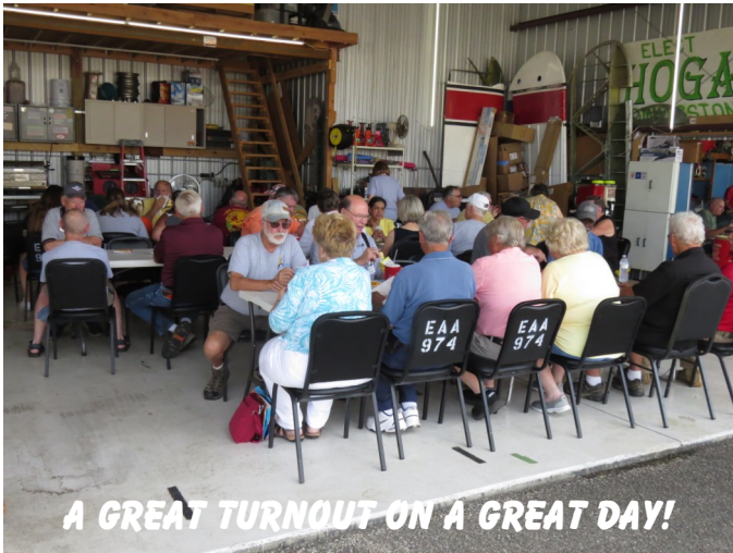
A GREAT TURNOUT ON A GREAT DAY!