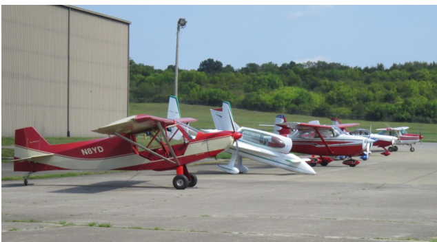
NICE LINE-UP OF 10 SHIPS TO FLY KIDS!